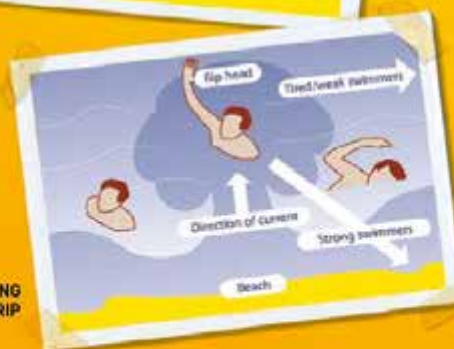
ESCAPING A RIP