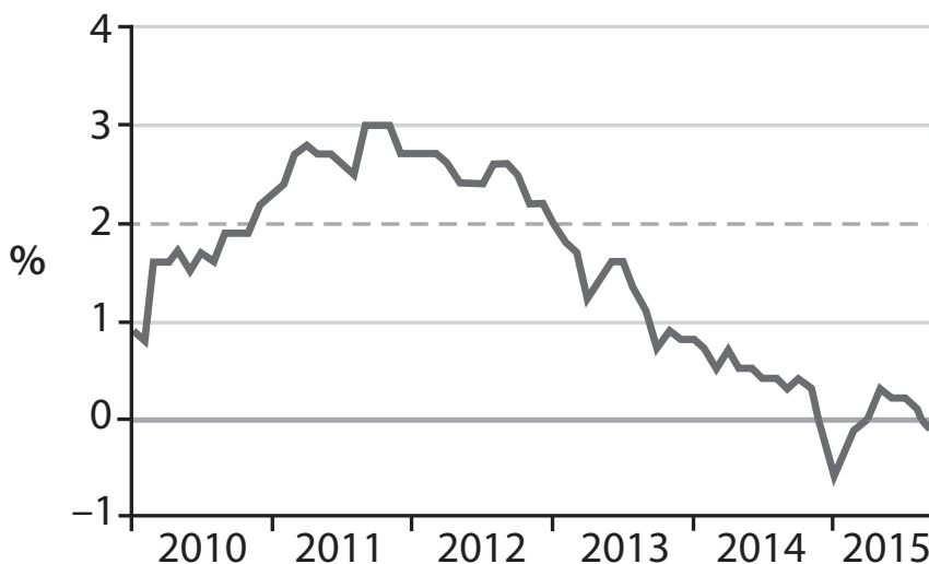
Figure 1 Eurozone CPI rate of inflation, 2010 to 2015