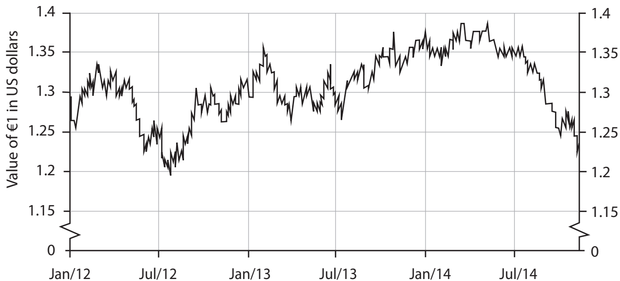
Figure 2 Euro-US dollar exchange rate, January 2012 to November 2014