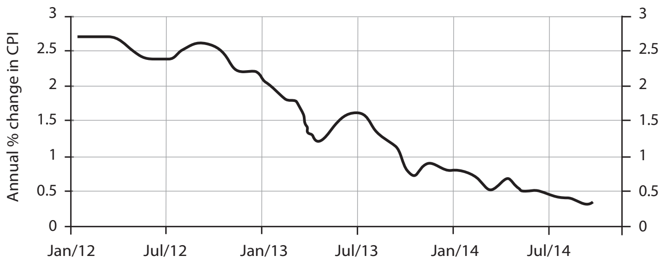
Figure 1 Eurozone inflation rate, January 2012 to November 2014 (annual % change in Consumer Price Index – CPI)