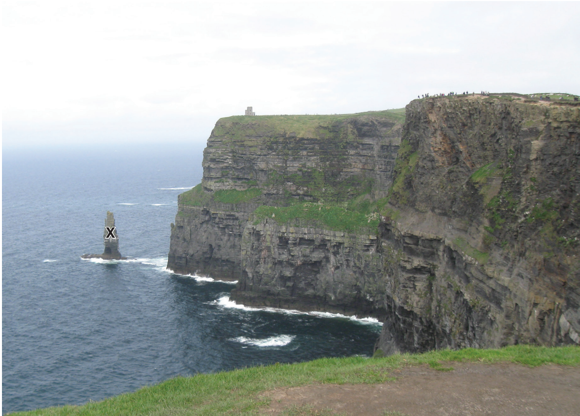
Fig. 4.1 for Question 4