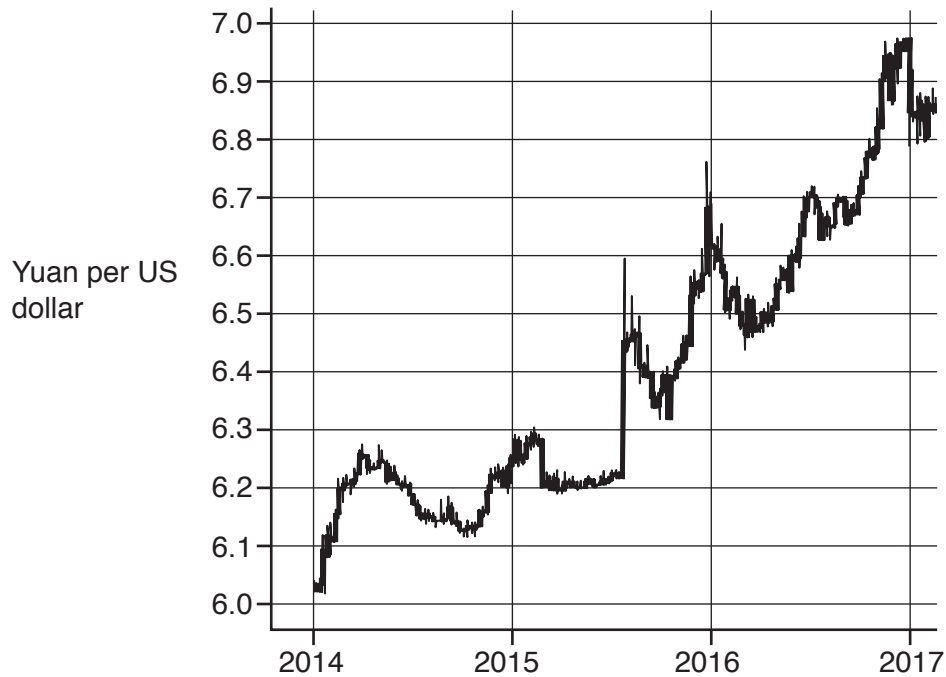
Fig. 1.1: Yuan–US dollar exchange rate, 2014–2017